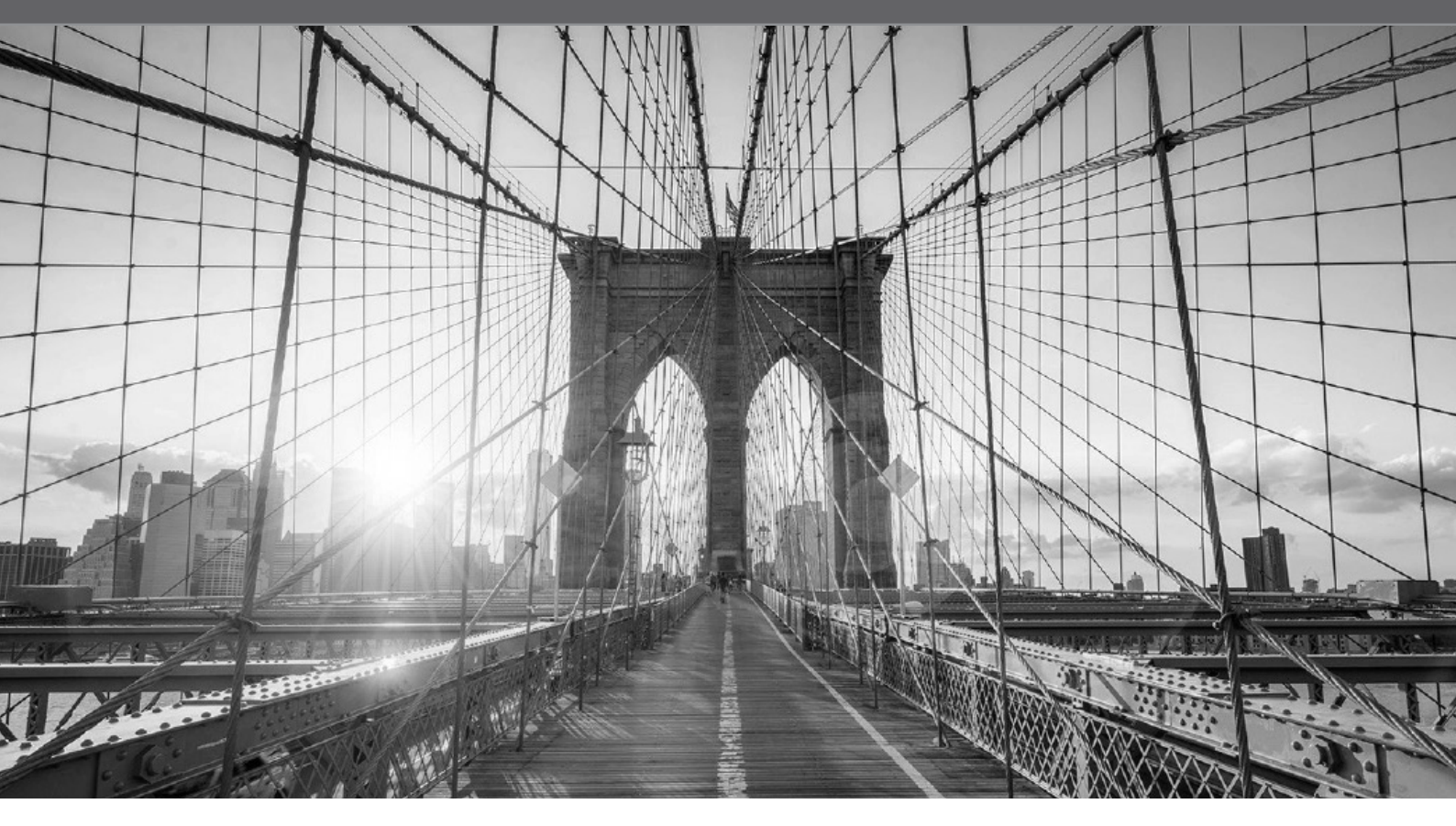
POSITION PAPER NEXT GENERATION CAPITAL MARKET